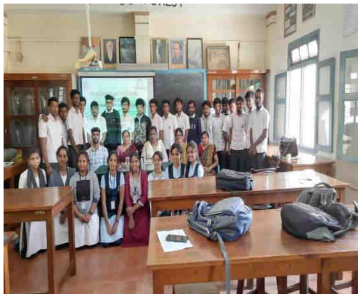
One day workshop on Bioinformatics 19 th Aril 2024