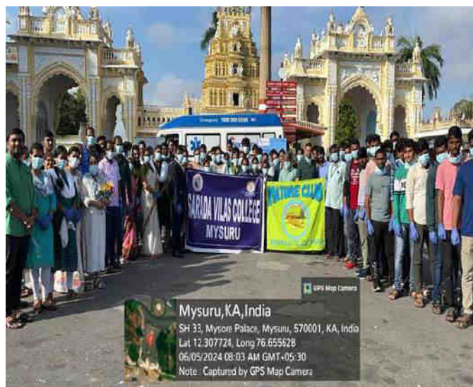
Cleaning the palace premises

The department of Botany and Zoology In association with Youth for Seva, Mysuru, and Nature club of Sarada Vilas College, Mysuru has organized a clean drive in the palace grounds of Mysore palace on the occasion of World Environment Day on 05 th June 2024 The clean drive was witnessed by the faculties, students and Non-teaching staff of Sarada Vilas College, Volunteers of Youth for Seva organization. The clean drive was carried on for almost one hour where students and faculties were involved actively in cleaning the palace premises.