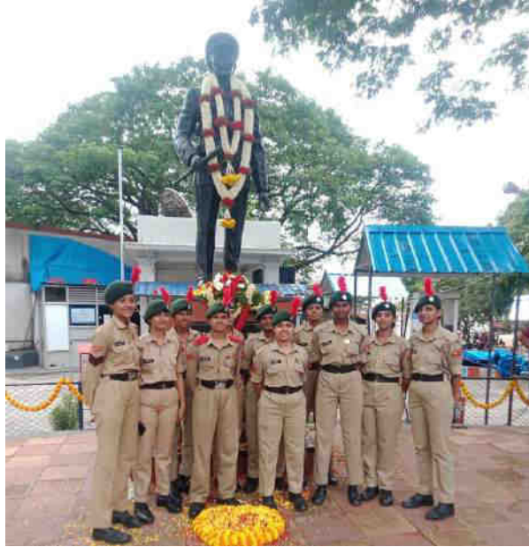
Kargil Vijay Diwas – 2024 Celebration - General Cariappa Statue, Metropole Circle, Mysuru.

Kargil Vijay Diwas - 2024 organized by 13/KAR/BN/NCC, Mysuru in association with NCC Army Wing and Sarada Vilas College, Mysuru on 26 th July 2024.