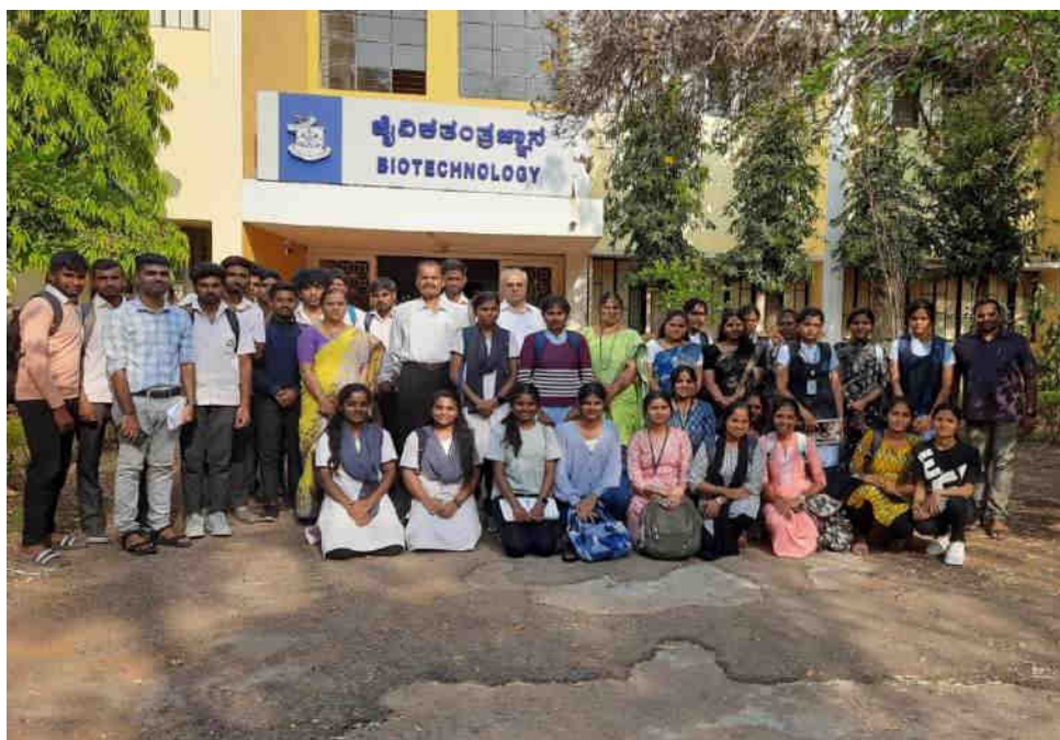
Visit to DoS in Biotechnology, Manasagangothri, Mysuru on 18 th March 2024 with VI semester students

The department of Botany had organized a visit to Department of studies in Biotechnology, Manasagangothri, University of Mysore, Mysuru on 18 th March 2024 for VI semester students of B.Sc. Chemistry, Botany and Zoology Course as prescribed in the curriculum by the University of Mysore.